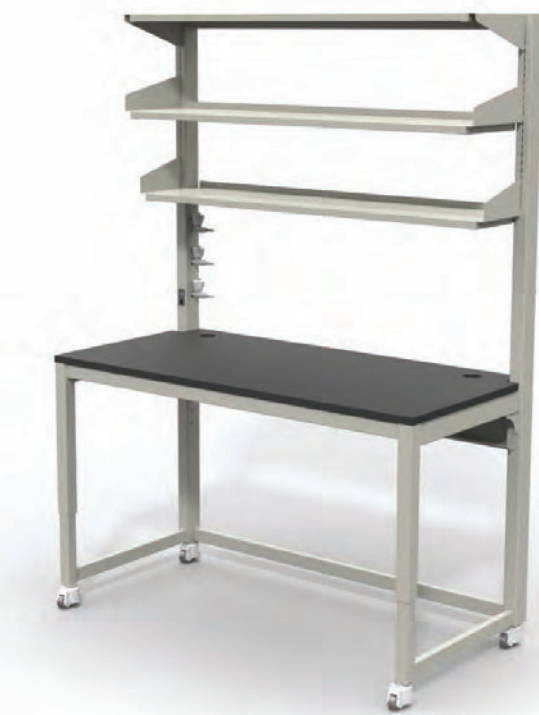
Altus™ Mobile Solutions - Heavy-duty swivel casters have leveling capabilities for times when you need both mobility and absolute stability.