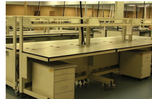
Sigma Carts™ are highly adaptable and can be conveniently integrated into existing work spaces or located as self-supporting work stations, making them perfect for sharing instrumentation, tools, or processes. Ergonomic work surfaces and shelves are height adjustable in 1" increments to easily adapt to new tasks, equipment and users.