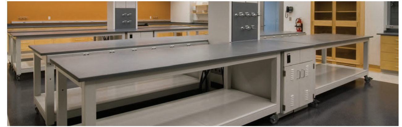
Mott offers a variety of cost-effective tables to fit the unique needs of every type of lab. Tables are available in powder coated steel, stainless steel or wood. We offer a wide selection of tables, fully welded, adjustable, mobile, hydraulic, vibration isolation and more...