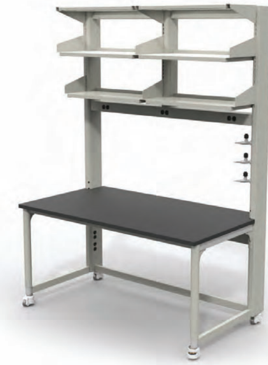
Optima™ Mobile Solutions - Heavy-duty swivel casters have leveling capabilities for times when you need both mobility and absolute stability.