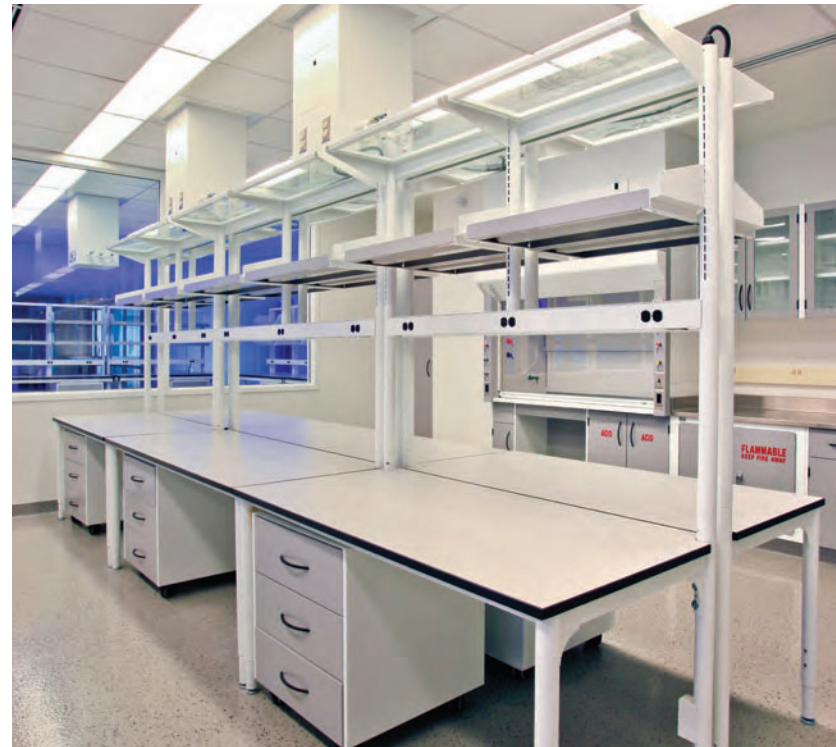
Optima™ 2100 Series can be used as a single-sided system or benches can be placed back to back to create a double sided work bench. This system is 84" high and has 2" round rear posts and front legs. Work surfaces and shelving can be adjusted in 1" increments to accommodate the requirements of individual users. Integrated plumbing, electrical and data allows for quick and easy access to services.