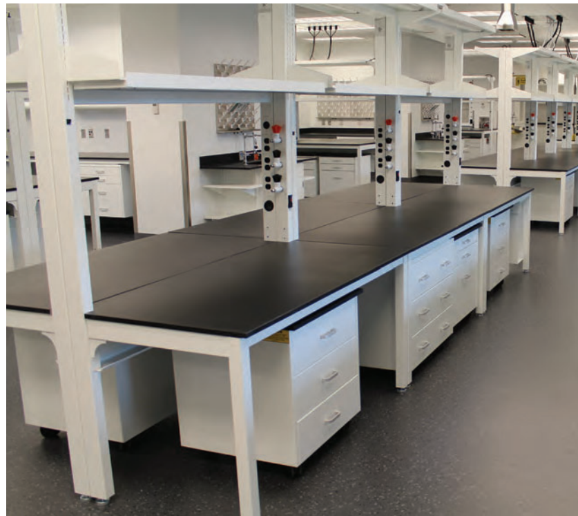
Altus™ Table Systems are reliable, attractive and affordable. Flexible for changing laboratories; these tables easily integrate into your into your existing lab or use them as a basis of a freestanding easily modified new lab. The table frame is all-welded construction and 84" high. Work surfaces and shelving are adjustable in 1" increments to accommodate the requirements of individual users. Integrated plumbing, electrical and data allows for quick and easy access to services.