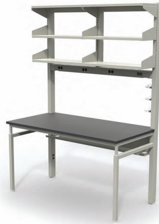
Tailored Solutions - We're committed to understanding your needs and developing solutions that better support your laboratory. Mott has designed and manufactured thousands of tables to fit the unique requirements of every type of lab; simply contact us with your needs.