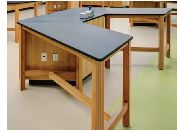
Flexible Lab Spaces - Multi-functional areas need to be user-friendly and easily reconfigured for different users, equipment or changing process. Tables can be put to use to increase productivity and ultimately, saving money. They are perfect for sharing instruments between different work areas or labs. Tables can be equipped with casters or leveling feet. Tables can accommodate our full range of suspended cabinets, shelves and drawers.