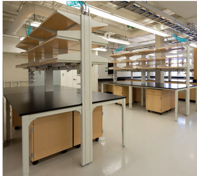
Optima™ 2550 Series can be used as a single-sided or double-sided bench system. This system is 84" high and has 6" deep "D" shaped rear posts and round front legs. Work surfaces and shelving can be adjusted in 1" increments to accommodate the requirements of individual users. Integrated plumbing, electrical and data allows for quick and easy access to services.

Everybody's needs are unique. Mott provides solutions to meet your specific application demands; simply contact us with your needs.